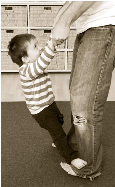
Father-infant interactions include physical play that is important for social and cognitive development.