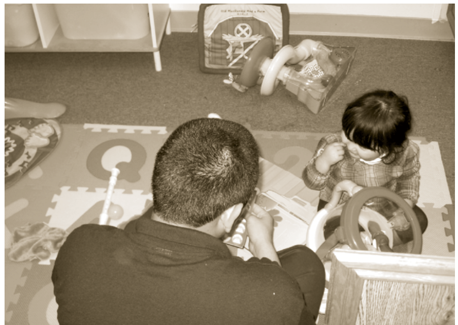
Figure 3. A father-child visit.

Photo printed with permission from caregiver and youth.