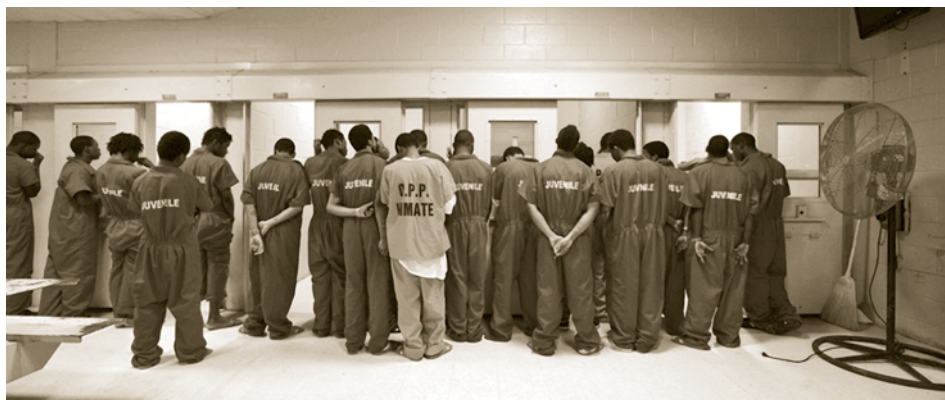
Parenting from a distance: The Juvenile justice setting is typically not conducive to forming a father-child attachment.