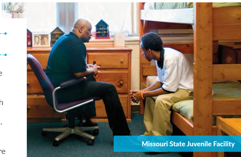
Missouri State Juvenile Facility

"Missouri places youth into closely supervised small groups and applies a rigorous group treatment process offering extensive and ongoing individual attention, rather than isolating confined youth in individual cells or leaving them to fend for themselves among a crowd of delinquent peers." (Mendel, 2010)